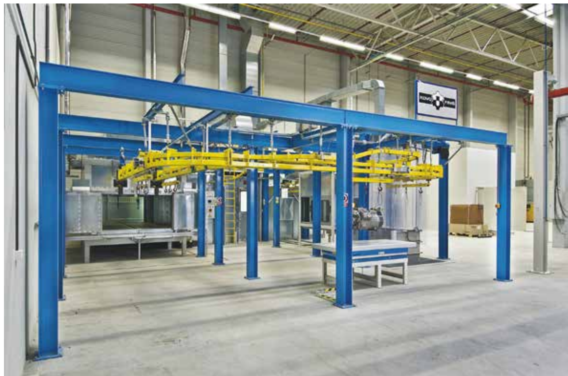
Lines for paint coating