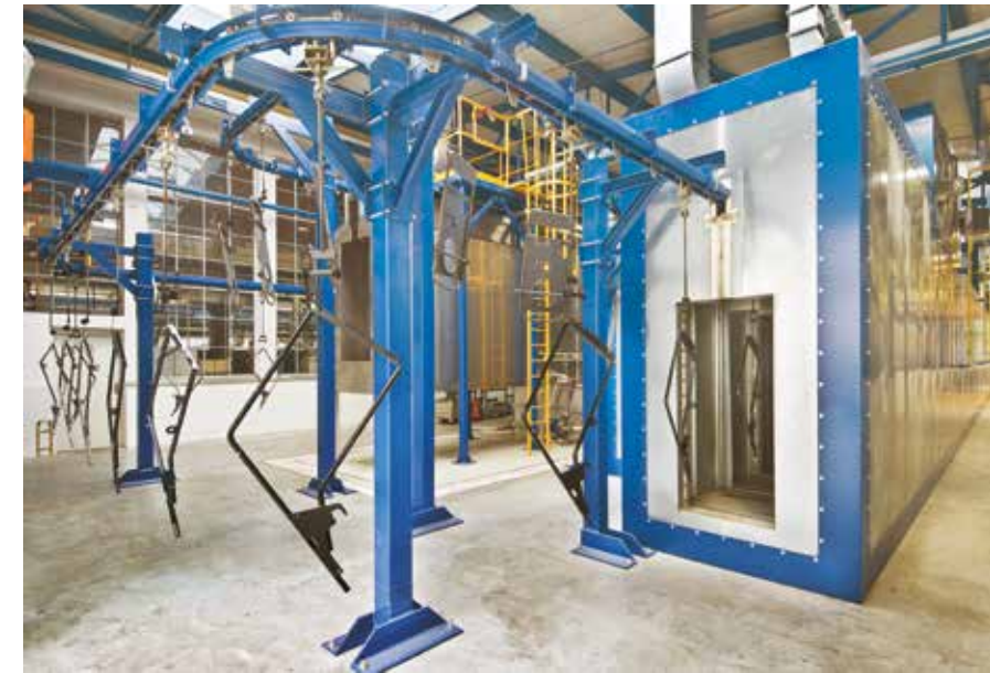
Equipment for manual and automatic paint coating